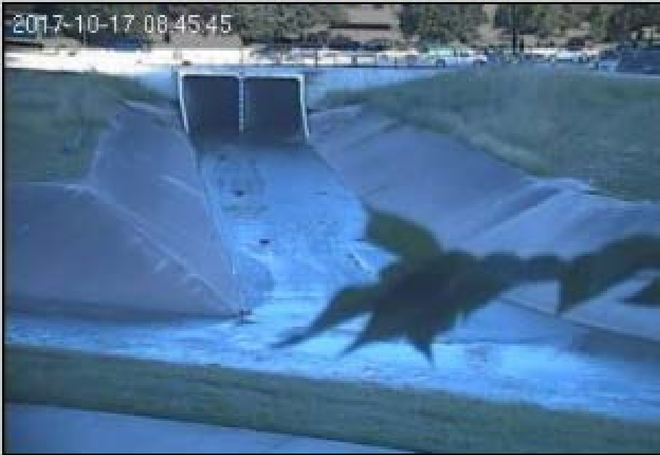
Brays Bayou at Harris Gully Inlet